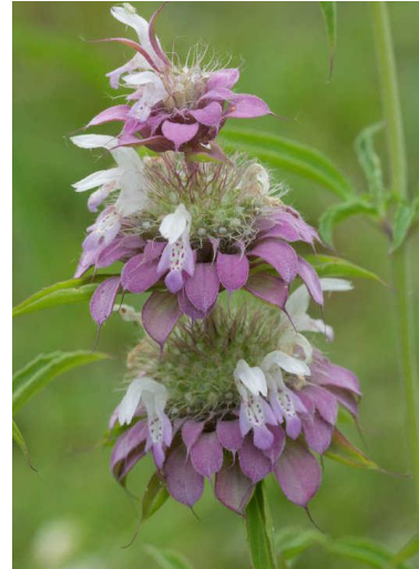
Lemon beebalm ( Monarda citriodora ).

multiple flower clusters along the same stem in this species. Bracts below the flowers are pinkish to purplish to white, and the flowers are yellow to off-white with purple spots – what a colorful contrast! In my opinion, this species is a great choice to grow in well-drained gardens in coastal Mississippi and elsewhere.