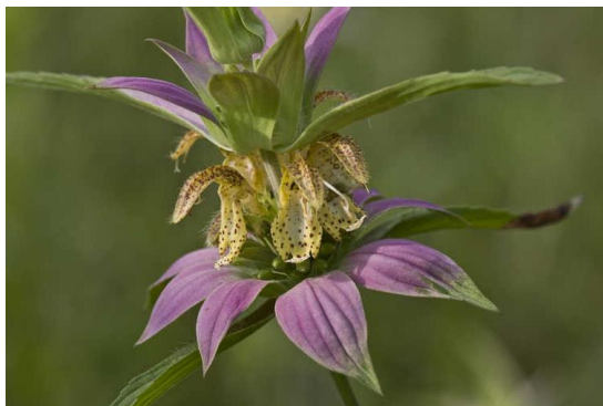
Horsemint, or, spotted beebalm ( Monarda punctata )

times, physicians used horsemint ( M. punctata ) as a digestive aid, diuretic, and stimulant, among other applications. Oil from horsemint has a high concentration of the antioxidant and antiseptic thymol (named after the related commercial mint thyme, Thymus vulgaris , native to the Mediterranean region of Europe and the Middle East), and horsemint has been grown in the United States as a source of thymol, especially during World War I. Leaves of the Appalachian Oswego tea ( M. didyma ) have been used to flavor meats. The fragrance of wild bergamot ( M. fistulosa ) has been compared to bergamot orange, and I personally think the smell is reminiscent of oregano ( Origanum vulgare ), another mint native to the area around the Mediterranean Sea. Oil from lemon beebalm ( M. citriodora ) has been employed as a pomade to make hair stay in place and to give hair a smooth and shiny appearance.