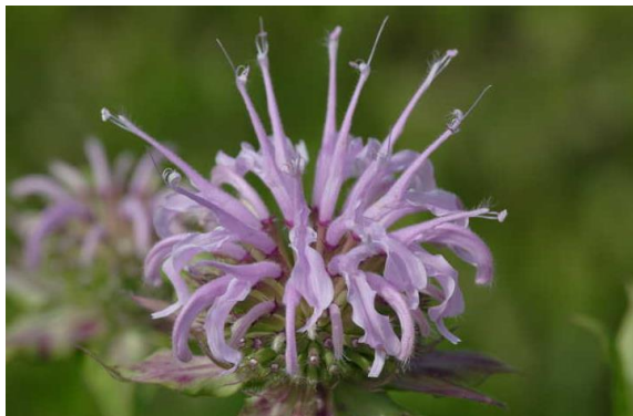
Wild bergamot ( Monarda fistulosa )

Horsemint, or spotted beebalm ( Monarda punctata ), like wild bergamot, is a perennial up to about three feet tall. There are