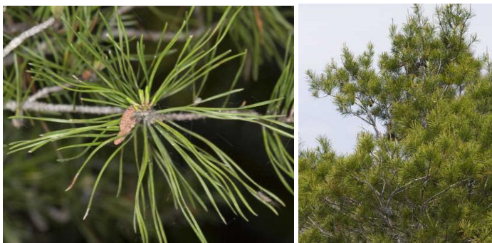
Needles and mature form of sand pine ( Pinus clausa ).

Seven different species of pines have been documented in Mississippi: sand pine ( Pinus clausa ), shortleaf pine ( P. echinata ), slash pine ( P. elliottii ), spruce pine ( P. glabra ), longleaf pine ( P. palustris ), loblolly pine ( P. taeda ), and Virginia pine ( P. virginiana ). Of these, all have been found in Crosby Arboretum natural areas except for sand pine and Virginia pine. No wonder much of southern Mississippi, including the lower Pearl River Drainage Basin, is known as the Piney Woods, especially because of the presence of longleaf pine!