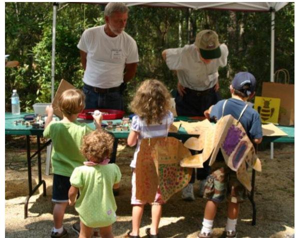
The children's craft activities at our annual BugFest event is usually a very popular destination for families!

Grab your cart and choose from an outstanding selection of native plants for fall planting projects. Knowledgeable staff, volunteers, and Mississippi Master Gardeners will assist you with your plant questions and provide advice on appropriate plant selections for your property's unique environmental conditions. Free site admission. Sale to be held in Greenhouse area. Use Service Road entrance.