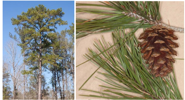
Mature shortleaf pine ( Pinus echinata ), needles and cone.

Collectively, all pines in Mississippi are wind-pollinated and wind-dispersed, single-trunked trees that bear both male and female cones on the same trees (monoecious). Male cones are short-lived, finger-like structures that are more abundant on the lower branches, whereas female cones are the larger, more familiar pine cones that characteristically take at least two years to mature and are more common on the upper branches – this positioning of the male and female cones helps to avoid self-pollination. Pollen from pines is unmistakable in having two air bladders that resemble “Mickey Mouse ears” when viewed under the compound light microscope. Much of that familiar “yellow dust” on our vehicles during early spring is from native pines. Seeds from female cones have long wing-like appendages that help propel them through the air in helicopter-like fashion.