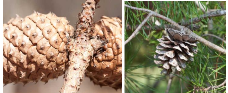
Loblolly ( P. taeda ) (L), and Virginia pine ( P. virginiana ) (R) cones.

Even though the wild form of sand pine usually appears gnarled, this species can be shaped into traditional-looking Christmas trees on farms in Florida. In fact, I purchased a sand pine marketed as a Christmas tree by the University of Florida School of Forest Resources & Conservation when I was a graduate student in botany there. I must say that it seemed every bit as good as a Scottish pine to me!