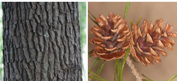
The characteristic bark, and cones of spruce pine ( P. glabra ).