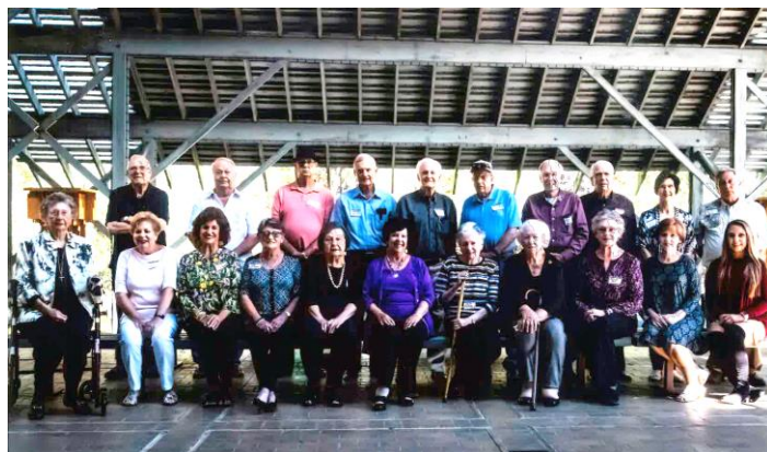
Picayune Memorial H.S. Class of 1954.