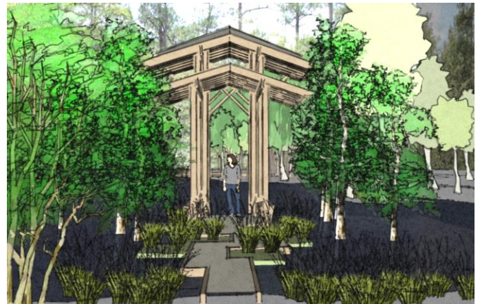
Elevation view of the Rosen Pavilion by Native Habitats, Inc.