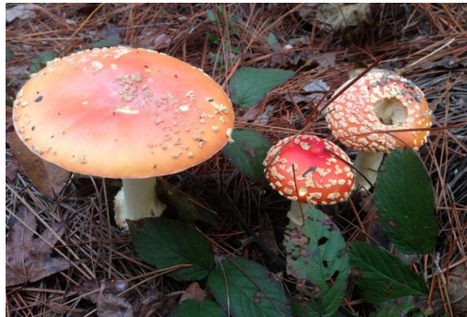
Colorful fly agaric mushrooms (Amanita muscari) are often spotted along the Arboretum pathways in the fall and winter.