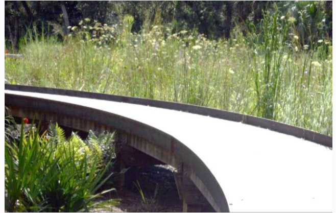
Amy Nichols also visited Bok Tower Gardens in Lake Wales, FL.

Nearby gardens you can visit include New Orleans Botanical Gardens, Longue Vue House & Gardens in New Orleans, LSU Ag Center Botanic Gardens at Burden in Baton Rouge, Birmingham Botanical Gardens, Mobile Botanical Gardens, Cheekwood Estate & Gardens in Nashville, Memphis Botanic Garden, Atlanta Botanical Gardens, and the Atlanta History Center (exhibits include a native garden in an old quarry!)