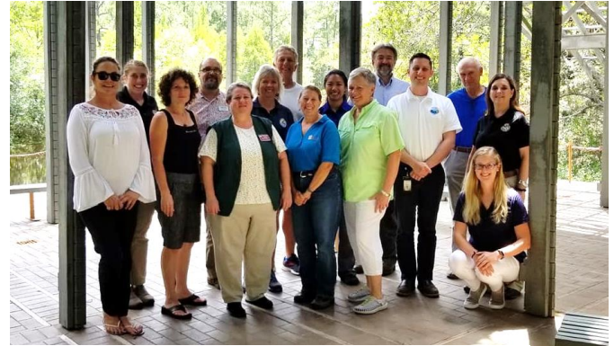
This summer, fifteen persons, including Arboretum staff and volunteers, received Certified Interpretive Guide training through a Gulf Coast National Heritage Area (MGCNHA) grant.