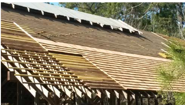
Remodeling of the Pinecote Pavilion is well underway. Shown above, the new roof installation in progress in February.