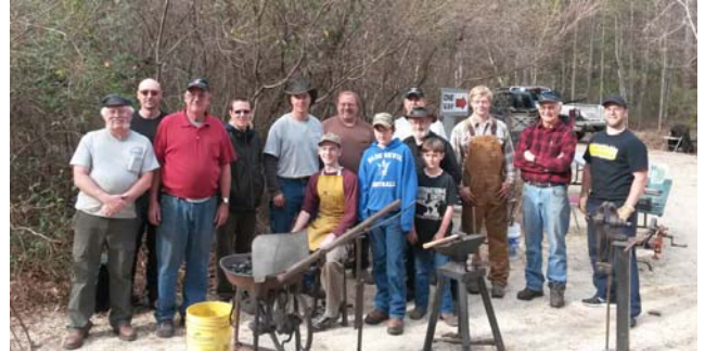
Forge Day 2015 brought local blacksmiths to the Arboretum who gave demonstrations to the public, teaching the traditional art of blacksmithing. Thank you for a great event!