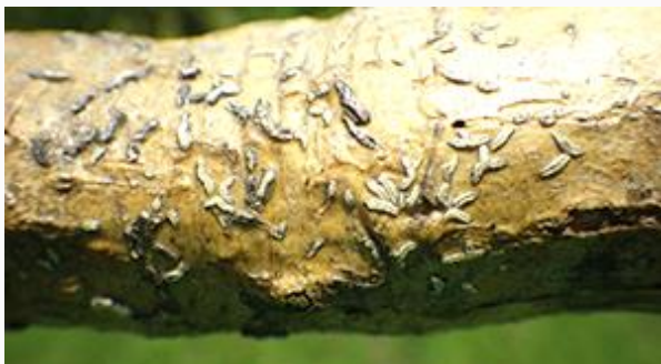
Powdered Script Lichen, Diplolabia afzelii, growing on an American holly. Note specialized bun-shaped lirellae, where spores are produced.