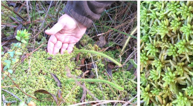
Jennifer points to sphagnum moss growing in the South Pitcher Plant Bog. It is found throughout the Arboretum.

This low-growing, true moss is often most noticeable in the wetter, more acidic areas of the Arboretum's pine savanna/pitcher plant bog. Looking like a lush green carpet, this keystone species (a plant or animal that many of the other species within the ecosystem depend on to survive) forms highly absorbent, thick vegetative mats consisting of thousands of these specialized small plants. Over time, as many of the Sphagnum plants die and begin to decompose, new ones become established on top of them, maintaining and expanding the mat. Because each plant (both dead and alive) in the mat can hold between 16 and 26 times its own dry weight in water in special empty cells found in their stem leaves, the mat acts as a giant sponge, absorbing and storing large amounts of water. This water is then available for other species of the bog, especially carnivorous plants, to use during times of drought. Sphagnum also has a unique ability to maintain the acid soil conditions that it requires. This acidity combined with the lack of oxygen in the wetland soils leads to a very slow rate of decay within the bog.