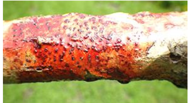
Bark Rash Lichen, with its characteristic crimson coloration and the raised perithecial warts.

I spent the first hour familiarizing myself with terminology specific to ascomycete fungi, members of the Phylum Ascomycota, the primary mycobiont (the fungus half of the relationship; the photosynthetic portion, the alga or cyanobacterium, is called the photobiont ). After an hour of turning pages (Did it really take that long for me to turn 613 pages? No, but as any good naturalist, I got side-tracked many