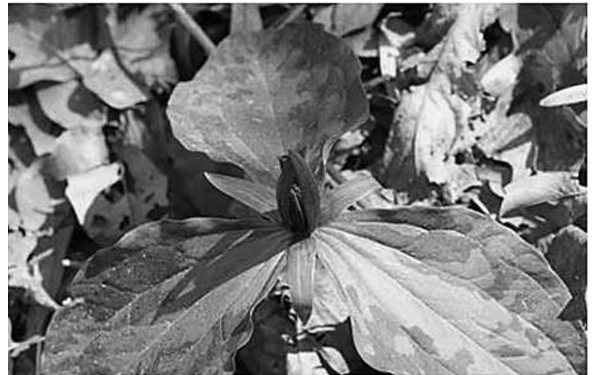
Mississippi River Wakerobin or Trillium foetidissimum.

In the past I have found trilliums in the state park in Natchez, along the southern portions of the trace, outside of Hattiesburg in Ragland Hills, near Tishomingo State Park and in a small secluded area of Jones County, but this year I missed finding any trilliums blooming here in