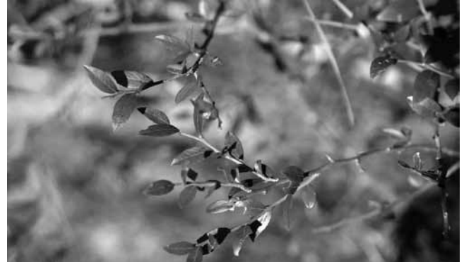
Elliot's blueberry.