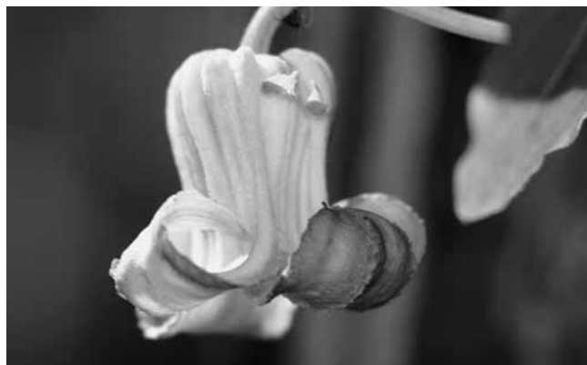
A Clematis crispa bloom found on the trunk of a pond cypress, in the Arboretum's Cypress Cove.

Visitors to the Arboretum's November Piney Woods Heritage Festival reported having great fun exploring the Pond and Savanna Journeys using the new Crosby Arboretum Nature Explorer application by GPTrex, Inc. The application offers an interactive, family-friendly application for persons with iPhones, iPads or iPod Touches. Instructions for downloading and using the "app" are available in the Arboretum Gift Shop for persons with an Apple mobile device. The free pilot adventure provides "more to explore" for visitors of all ages with beautiful hi-resolution images of plants and animals, streaming video, GPS mapping, and challenge questions. There are nine stops, developed by MSU Professor Bob Brzuszek, that tie into the map on the app. Feedback is being collected, and a survey is located on the app's last stop. Upon completion of the survey, participants will be directed to come to the Visitor Center Gift Shop and receive a Crosby app certificate and a special prize! We are pleased to be able to offer this new method for our visitors, especially families, to explore and interact with the Crosby Arboretum.