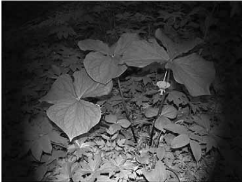
Nodding Trillium, Trillium flexipes .