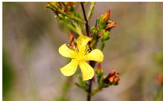
Coastal Plain St. John's Wort ( Hypericum brachyphyllum ) http://www.southeasternflora.com/view_flora.asp?plantid=713

Several of the St. John's worts native to south Mississippi lend themselves to ornamental use. The rounded, but wiry, typically knee- to waist-high form of Hypericum brachyphyllum would seem well-suited as an ornamental in a rock garden (using pea gravel) in sunny, poorly-drained areas. Hypericum lobocarpum , in the bushy St. John's wort ( H. densiflorum ) group, does well along fences in transition areas between manicured lawns and adjacent woodlands; it really puts on a show with numerous golden blooms contrasting with its smooth green foliage in late June through early July (around the time of St. John the Baptist Day). Other species, such as cedarglade St. John's wort ( H. frondosum ), especially characteristic of central Tennessee, has flowers up to two inches across and has long been in the horticulture trade.