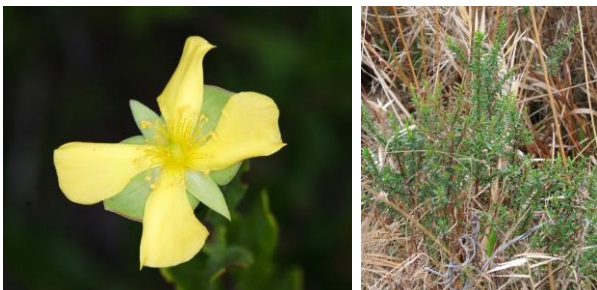
Hypericum crux-andreae (Left); H. brachyphyllum (Right) http://www.southeasternflora.com/view_flora.asp?plantid=736

Hypericum brachyphyllum and H. fasciculatum , both shrubs that are indicative of fire-prone wet savanna/pond cypress swamp ecotones (Hillside Bog and Dead Tiger Creek Savanna & Hammock natural areas), have wiry branches and numerous needle-like leaves that help them conserve water in their generally more open, sunny environment. Pineweed ( H. gentianoides ) of dry pinelands has among the most extreme adaptations to conserve water. In this plant, leaves are reduced to scales, and the green stems take over the job of photosynthesis!