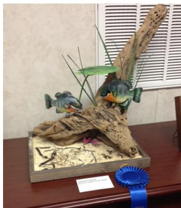
James Fornea, 1 st place 3D