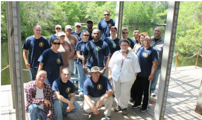
A U.S. Navy CNMOC crew from Stennis Space Center provided day of community service for the Arboretum on May 8.