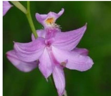
Grass pink orchid ( Calopogon tuberosus )

Like most orchids adapted for temperate climates, the vast majority of orchid species native to Mississippi are terrestrial. Several of these are rare plants and are indicative of natural communities worthy of conservation efforts. Habitats range from old-growth deciduous forests in deep ravines in the northern part of the state, to fire-prone, grass-dominated savannas and carnivorous plant bogs, such as Dead Tiger Creek Savanna and Hillside Bog at the Crosby Arboretum, in southern Mississippi. Grass pinks ( Calopogon spp.), ladies'-tresses ( Spiranthes spp.), and fringed orchids ( Platanthera spp.), among other species, occur here in acidic, nitrogen-deficient soils. Similar to many epiphytic orchids, these native terrestrial species like easy access to light. Historically, frequent lightning strikes in the mosaic of longleaf pine forests, savannas, and bogs in southern Mississippi started quickly-moving fires of low intensity that kept out many shade-producing, broad-leaved trees and shrubs. These fires would also help release soil nutrients, trigger seed germination, and stimulate blooming of pineland plants. Today, land managers must set prescribed, controlled burns to simulate these conditions. Without this practice, many plants and animals native to southern Mississippi would simply disappear. When properly managed, savannas can support 40+ plant species per square meter, making them the most diverse plant communities in all of North America outside the tropics!