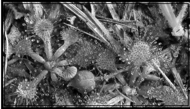
Drosera brevifolia , dwarf sundew.