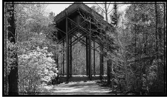
Rhododendron canescens, Piedmont azalea, in bloom near the Pinecote Pavilion, March 2012.