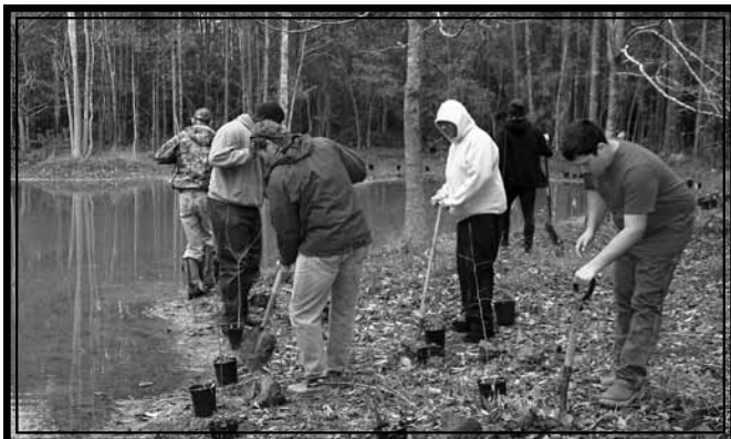
Students from Pass Christian High School volunteer planting trees at the Arboretum Gum Pond Exhibit, Arbor Day, February 2012.

The Crosby Arboretum will offer 2-hour programs for Girl Scouts of all ages working on environmental badges. Scouting groups may picnic before or after program times on the grounds as part of their visit. Program fees for Scouts and siblings is $8 per participant. Scout leaders and parent chaperones are free. Maximum number per group is 20 participants. All materials provided. Contact Girl Scouts of Greater MS to register at 228-864-7215 or register online at gsgms.org .