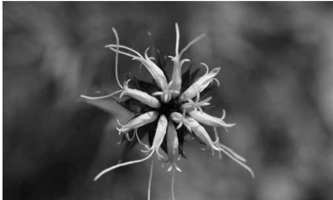
Liatris squarrosa at the Arboretum's Steep Hollow natural area.