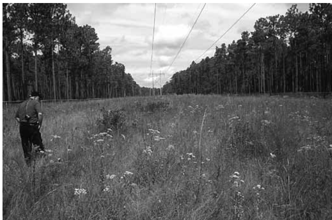
A power line area containing endangered plant species.

When the Spanish arrived in the Southeast in the early 1500's, large stands of longleaf pine covered 150 million square miles of the coastal plain, from the James River in southeast Virginia to northern Florida and westward to southeast Texas. These forests had developed since the last Ice Age. With European colonization came heavy deforestation of the longleaf pine, to support naval stores for resin, turpentine, and timber for European navies.