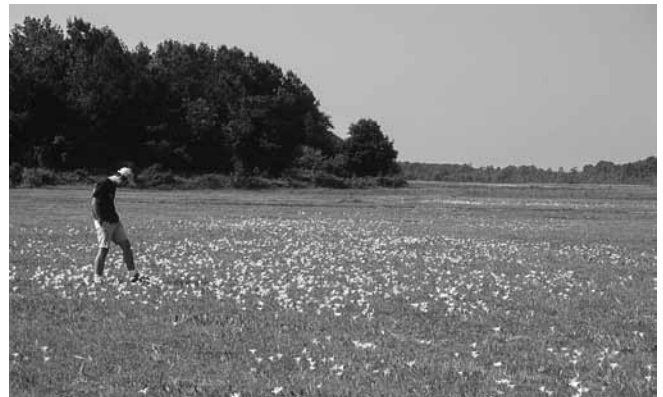
A field of atamasco lilies in the coastal plain.

Longleaf pines are adapted to fire. Periodic natural wildfires from lightning do not harm them, resulting in areas of open grassy savannas. Many coastal plain wildflowers evolved in the fire-regime areas and they became fire dependent for seed germination and removal of competing vegetation. When wildfires began to be controlled in the early twentieth century, many species declined. A few adaptable ones retreated to power-line, gas, and railroad rights of way, whose regular mowing and maintenance remove competing shrubby vegetation, thereby mimicking the openness produced by wildfires.